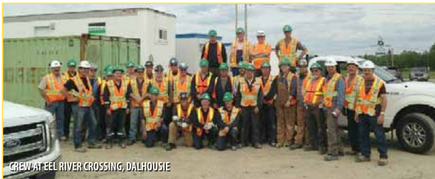
CREW AT EEL RIVER CROSSING, DALHOUSIE