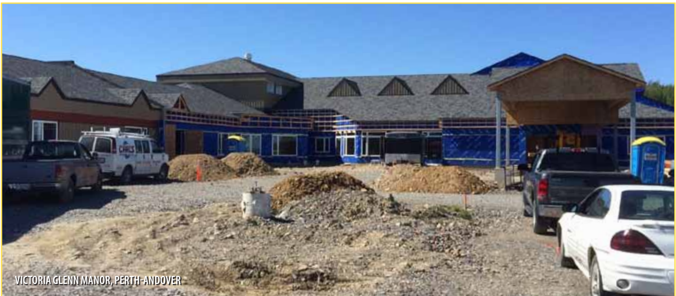
VICTORIA GLENN MANOR, PERTH-ANDOVER