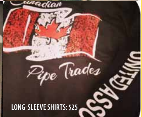
LONG-SLEEVE SHIRTS: $25