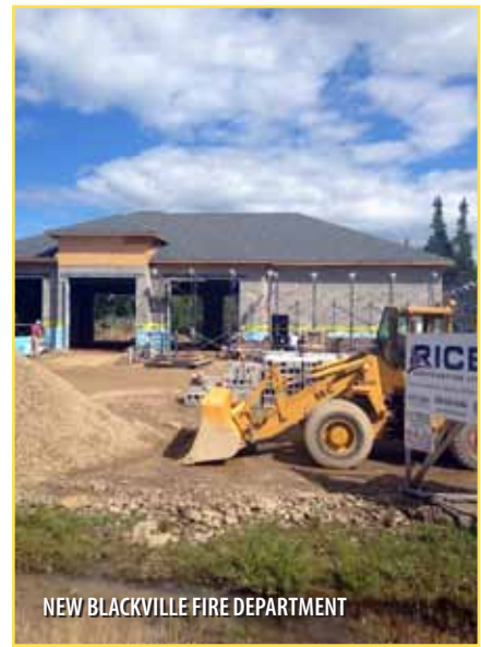
NEW BLACKVILLE FIRE DEPARTMENT