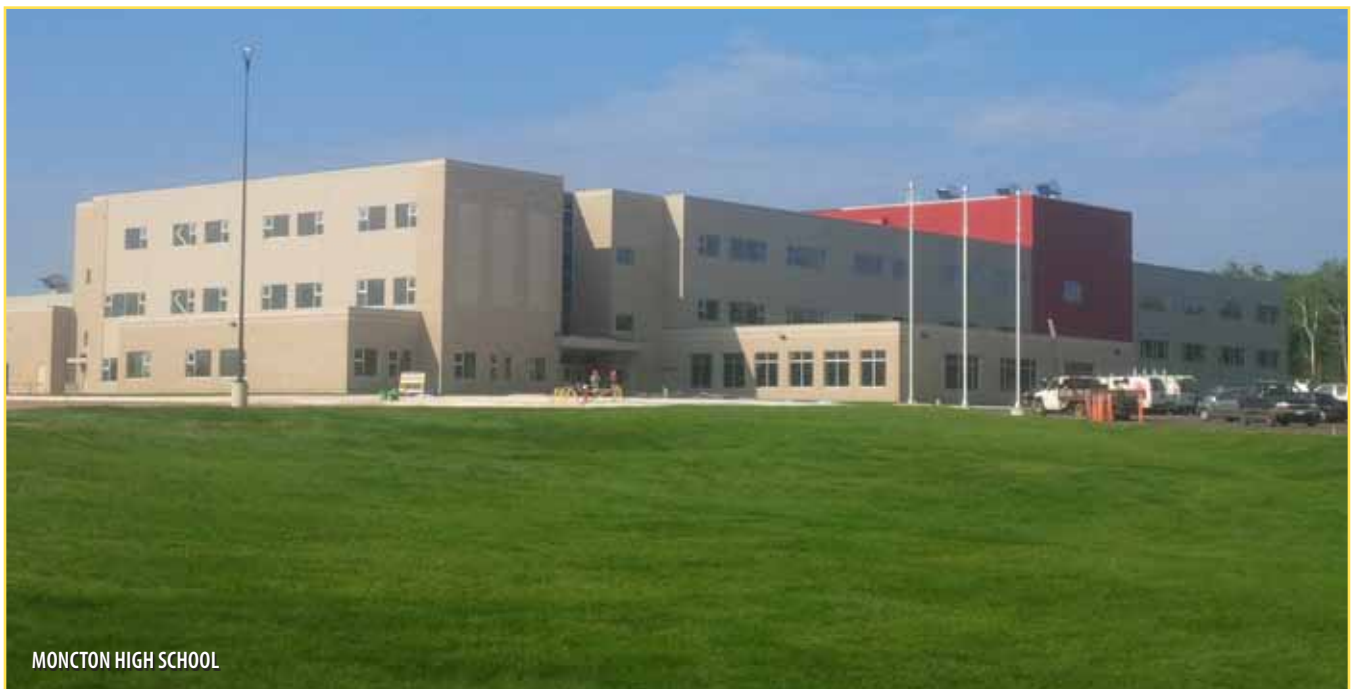
MONCTON HIGH SCHOOL